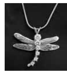
Custom Made Dragon Fly Pendant with family diamonds