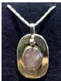
Hand Made Purple Quartz & Sterling Silver Pendant