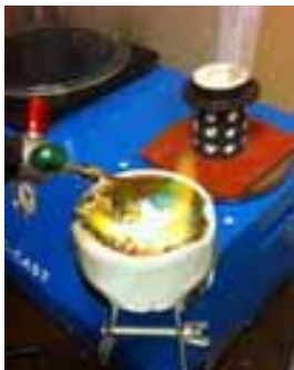
Metal casting flask

precious heirloom, engagement ring or other piece of fine jewelry. Add to that the comfort of knowing that your jewelry will be secure in our vault and not shipped all over the country to be fixed by a person you have never met, and you will begin to understand why RJ Jewelers takes great pride in being able to help you by providing this wonderful service. To find out how we can help you with your jewelry repair or custom design idea, please come to our store at 217 Grant Avenue in the Auburn Plaza. Our sales staff and goldsmith will be happy to help you.