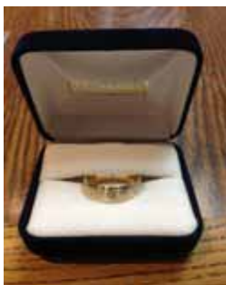
14kt Gold Scattered Diamond Wedding Band