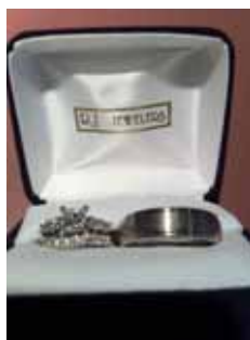
Custom Made Bridal Set