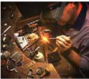
The Jewelry Doctor