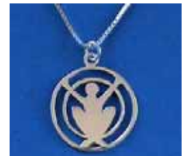
This unique necklace design started with a customers drawing. RJ Jewelers goldsmith Stephen Gonzales hand cuts each pendant in sterling silver. Power Of Mind Necklaces are on sale exclusively at RJ Jewelers.