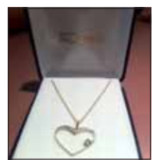
Custom Made Pendant for Wife's Anniversary made from husband's original wedding band